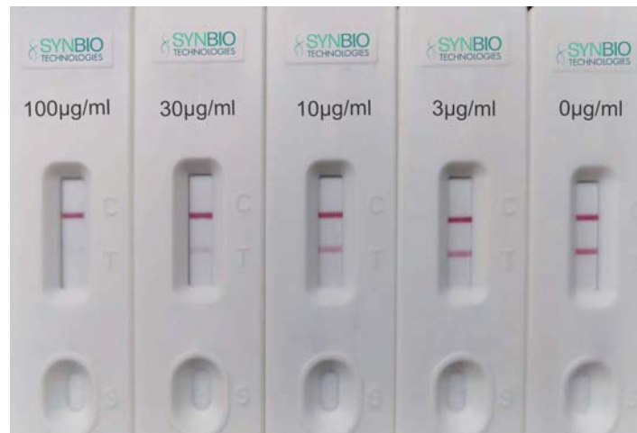
Test card color rendering display diagram